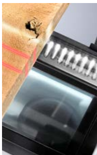
Scanning / Optimizing