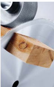
Ripping and Cutting